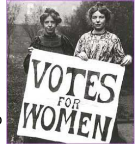
(Continued on page 3)