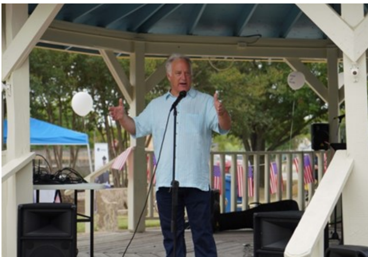
Senator Watson speaks at the Aug. 11 rally.

I'm also working closely with the Bastrop County Democratic Party to ensure that you have what you need to work to turn Bastrop blue, in part by financing the program for mail-in ballot applications to help make voting easier for folks in Bastrop County. The party is working hard and offers a lot of opportunities for people to help through blockwalking and other get-out-the-vote efforts.