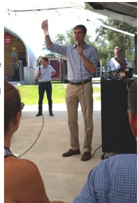
Beto O'Rourke speaks in Goliad.

Everyone listened intently as Rep. O'Rourke explained his vision for providing affordable healthcare for all; keeping our promise to our veterans; rebuilding our public school system; treating our teachers (both active and retired) with the respect they have earned; protecting our planet; and upgrading infrastructure to serve all Texans and to create jobs. His honest and rational approach to each issue had even the most conservative-minded attendees cheering with enthusiasm.