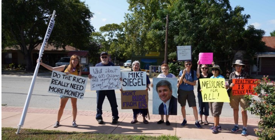
Aug. 1: Bastrop County In-divisible protests Michael McCaul's appearance at the Bastrop Chamber of Commerce's monthly luncheon meeting.

August was full of activities for the Bastrop County Democratic Party. As we get closer to the midterm election in November, our members are organizing, rallying, and taking to the streets in record numbers. And we've got lots of photos to share!