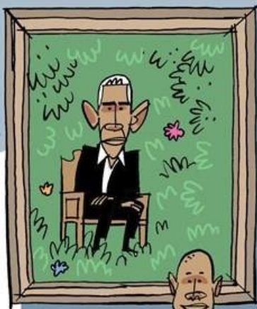
BARACK OBAMA BY KEHINDA WILEY