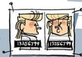
DONALD TRUMP BY ROBERT MUELLER