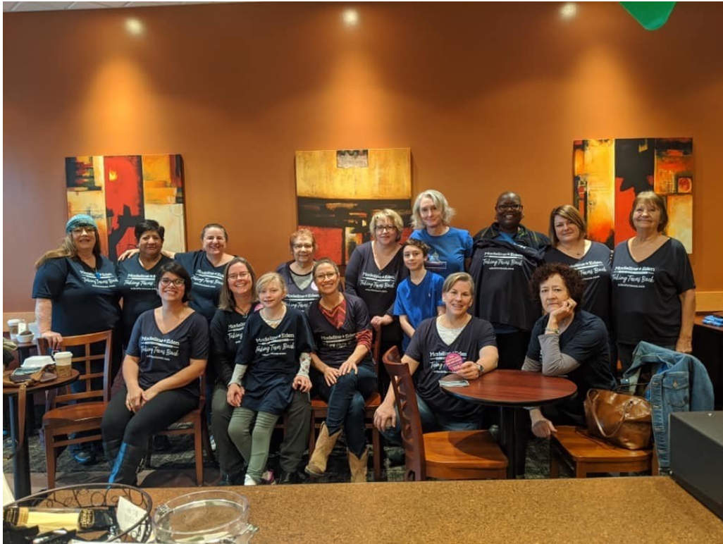
Bastrop County Democratic Women gathered to rally with Madi